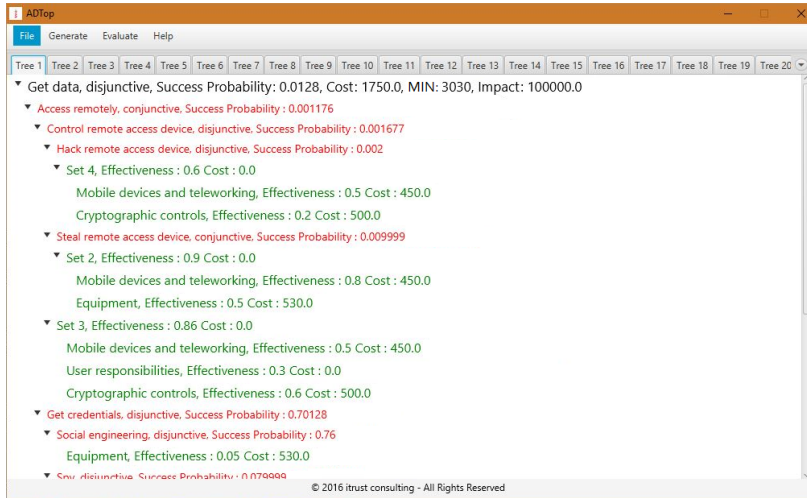
Fig. 3. Screenshot of the ADTop tool.